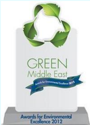
Recipient of Green Middle East Award 2012 for Alternative Energy Project