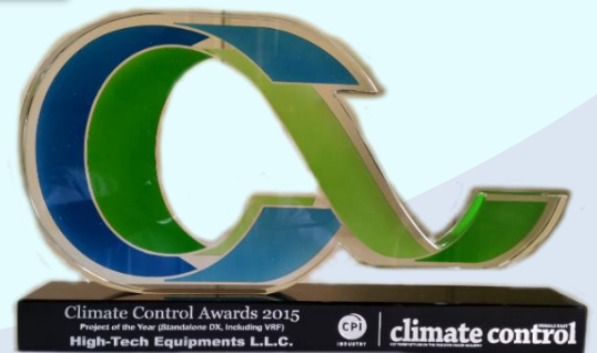
Recipient of Green Climate Control Award 2015 for Project of the Year Standalone DX, Including VRF